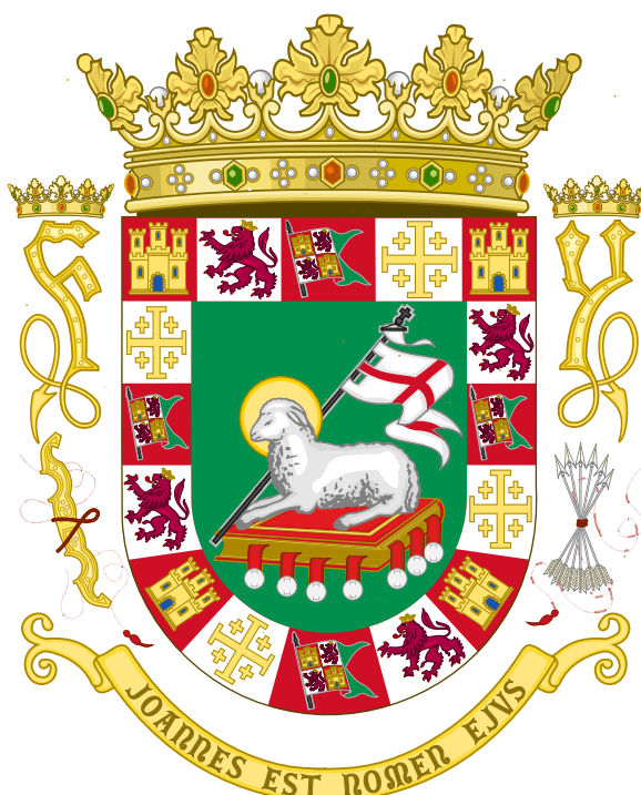
Fig. 5: Puerto Rican coat of arms, with the Lamb of God holding the Spanish flag. The lamb is associated with John the Baptist, the patron saint of Puerto Rico.

Across Latin America, cofradías formed as lay organizations that worked within a parish and under the direction of the parish priest but remained autonomous. In places where the Church was mostly absent (such as Puerto Rico), most Catholics primarily experienced public religion through cofradías rather than the Church. 68 The cofradía as an organizational structure developed before it made sense to distinguish between the religious and secular. When Padilla wrote that the Caballeros were "in essence more social than religious," he was treating them as a